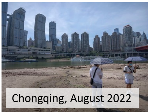
Chongqing, August 2022