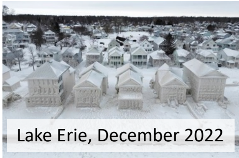
Lake Erie, December 2022