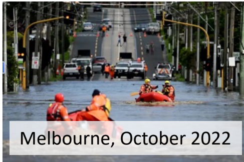
Melbourne, October 2022