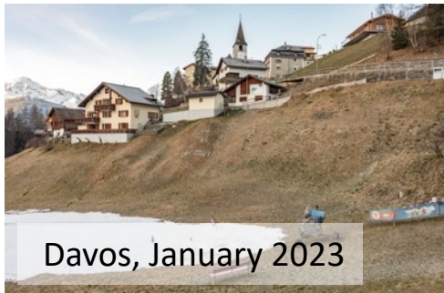
Davos, January 2023