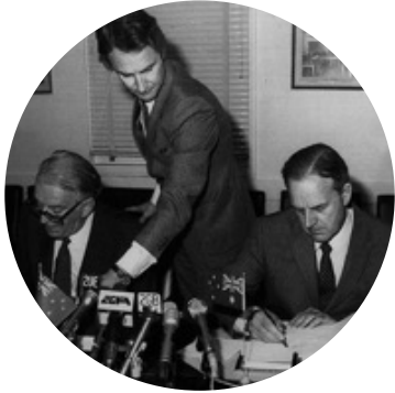
Signing of CER, March 1983