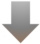
Annual SEM talks, Feb 2024